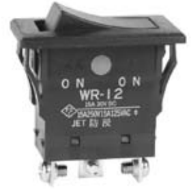
WR Rocker Before Label Change

WT, WR and WB Series with the PSE marking will have changes to the identification labels on the switch bodies, and the old logo will be replaced with the new one. The change will effect both standard and custom models, and includes all WT and WB models, and WR rockers with screw lug and wire lead terminals. The following table shows examples of the differences before and after the modification. The part number tables show standard models of each series effected by the change.