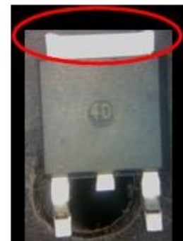
DPAK 4 rows Heat sink side is flat

Product Id Description : This ION covers Fairchild Semiconductor TO252/TT252 packages. Please refer to the affected FSID listing.