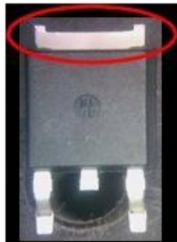
Current DPAK 3 rows Heat sink sides has protruding angles